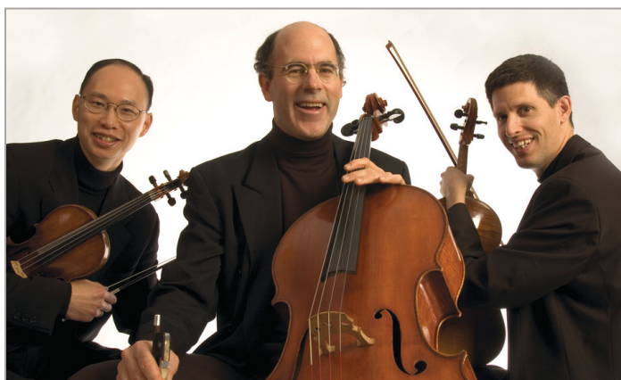
Adaskin String Trio

Joining us from Berlin on Sunday afternoon, March 10 , and featuring the sweet, pure sound we've been treated to in the past from European quartets like the Talich and the Cremona, the Armida Quartet will perform two towering quartets both composed in 1826 – Beethoven's Quartet in C-sharp Minor, Op. 131, and Schubert's Quartet in G Major, D. 887.