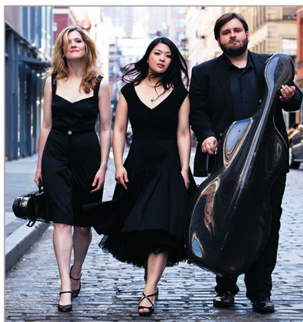
Neave Piano Trio

on Sunday afternoon, November 11 , with a program ranging from Haydn and Schumann to the dramatic and haunting Trio No. 2 of Dmitri Shostakovich.