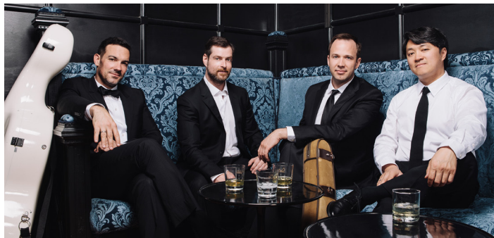
Miró String Quartet