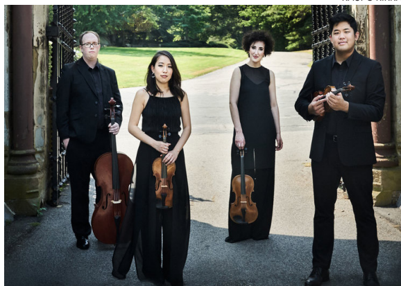
Verona String Quartet