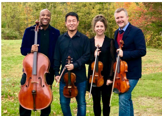
Apple Hill String Quartet